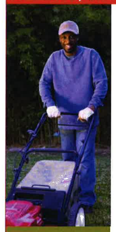
For more information about Lyme disease, visit http://www.cdc.gov/Lyme